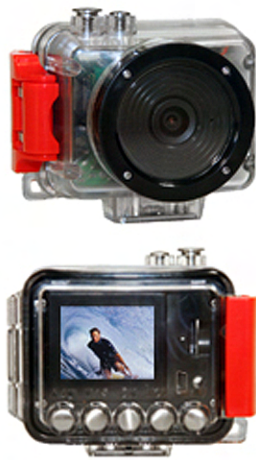
Intova Sport Pro