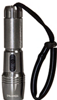
Tovatec IFL 550

2011 has been a challenging year with many different issues on the global news front. Tumultuous political events and tough economic realities have impacted buyer behavior all over the world. Intova's mantra: change is inevitable- we must always work on proactive improvements for company, products and systems. Towards that end, we have finished the complete reorganization of company workflow and implementation of a new software system. What headaches!! Now, the decks are clear, exciting new products are in the pipeline and 2012 should be fantastic. Please accept our Best Wishes for each of you in the coming year!!