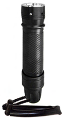
Tovatec iZoom Mini